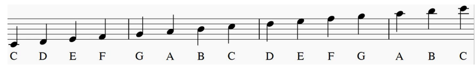
Notes on the treble clef